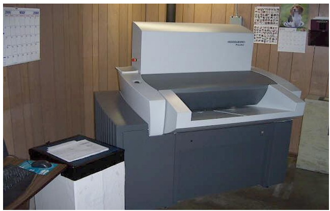
Computer-to-Plate (CtP) manufactured by Heidelberg, Germany 94