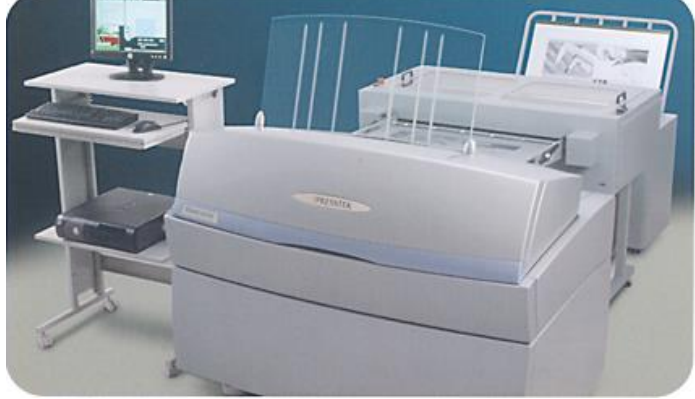
Sophisticated version of Computer-to-Plate (CtP)