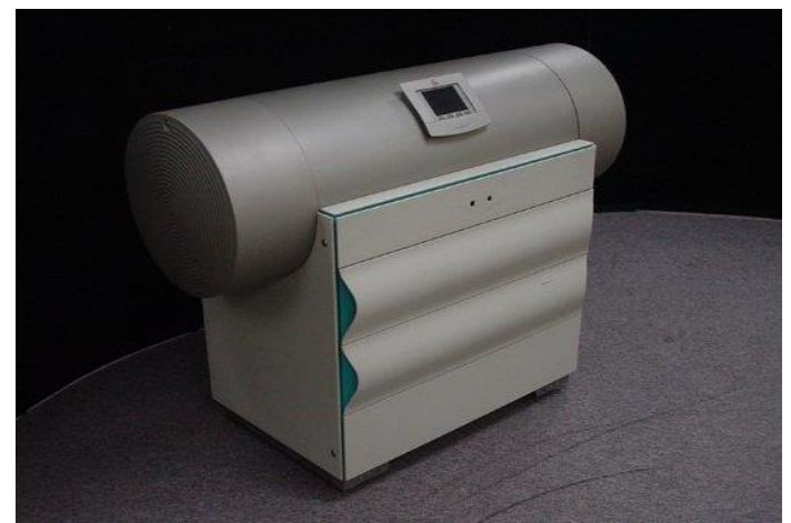
Drum Imagesetters (DOLEV & LOTEM 400/800 Imagesetter Printing Machine)